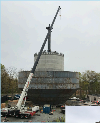
Prior to lift